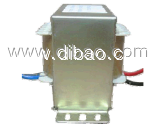
EI power transformer