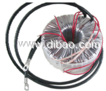
Toroidal power transformer